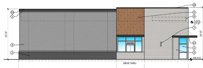
PRELIMINARY WEST ELEVATION SCALE: 1/8" = 1'-0" 3