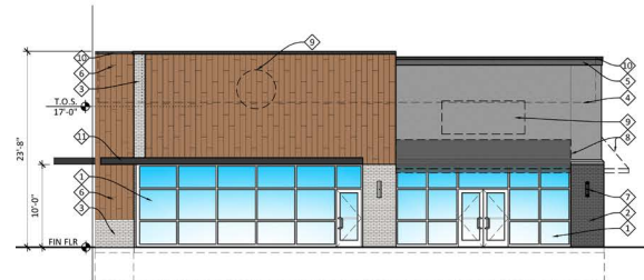
PRELIMINARY SOUTH ELEVATION SCALE: 1/8" = 1'-0" 4